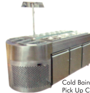
Cold Bain Marie Cum Pick Up Counter