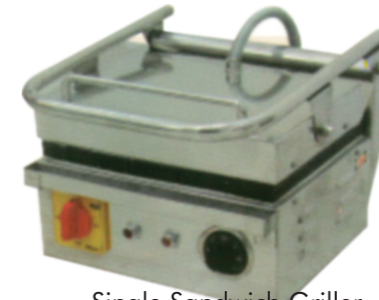
Single Sandwich Griller