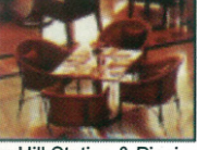
In Hill Station & Picnics