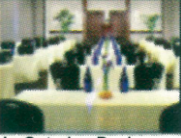
In Catering Business