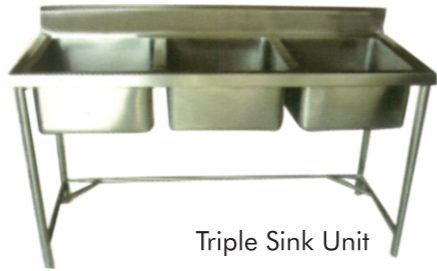
Triple Sink Unit