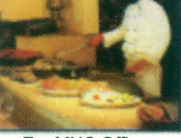
For MNC Offices