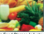
In Food Storage Industry