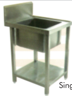
Single Sink Unit