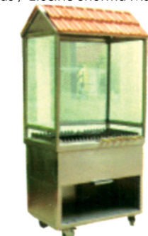
Bar-Be-Que with Stand