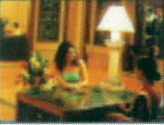
For Star Hotels