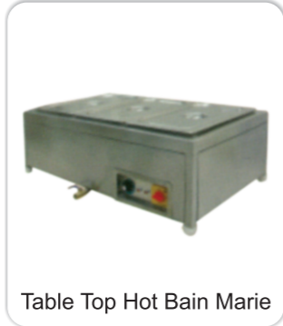
Table Top Hot Bain Marie

Available Product in Power Range (230V - 50/60 Hz) / (440V - 50/60 Hz)