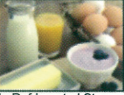
In Refrigerated Storage