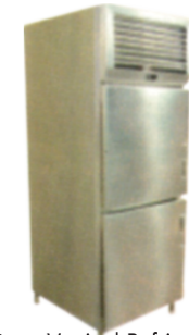
Two Door Vertical Refrigerator