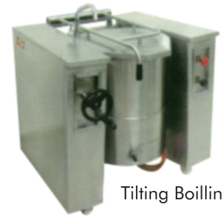
Tilting Boiling pan