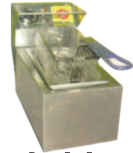
Deep Fat Fryer