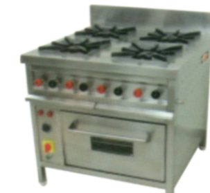
Continental Gas Range with Oven