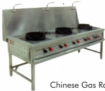
Chinese Gas Range