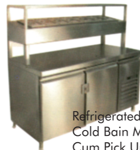
Refrigerated Cold Bain Marie Cum Pick Up Counter