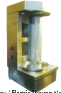
Gas / Electric Shorma Machine