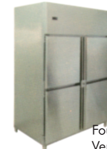
Four Door Vertical Refrigerator