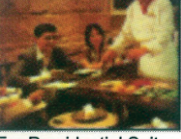
For Presidential Suites