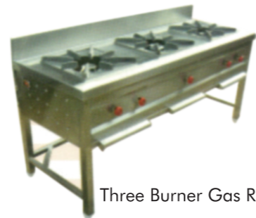
Three Burner Gas Range