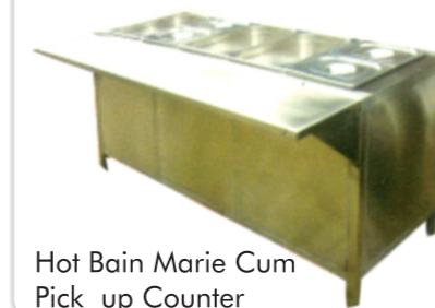
Hot Bain Marie Cum Pick up Counter